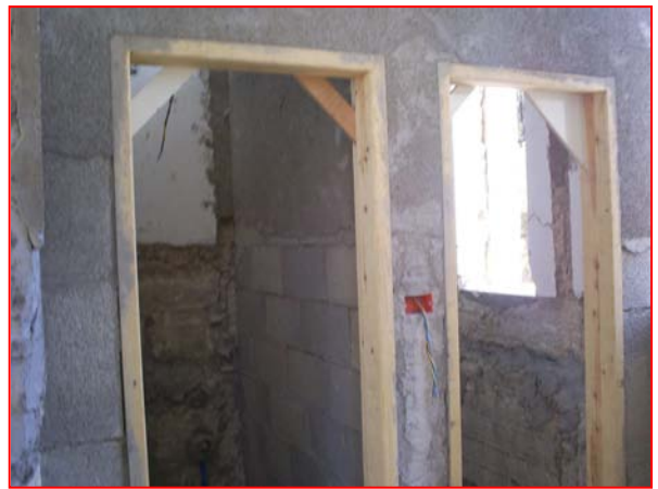
Work in Sanitary Unit