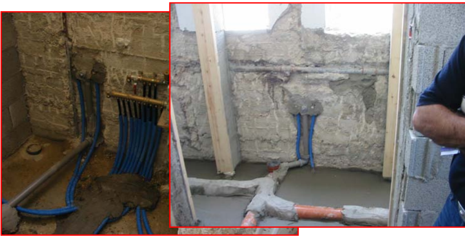
Pipe installation in sanitary units