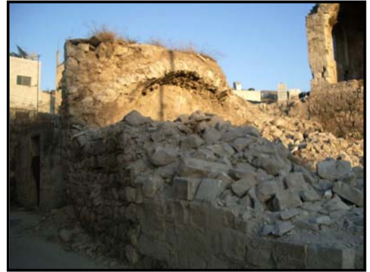
Existing Fill in the New Land