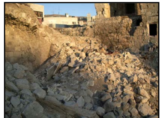
Existing Sensal for the New Land