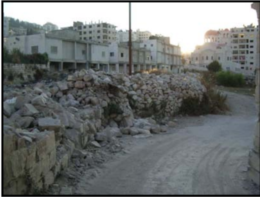
Existing Sensal for the New Land